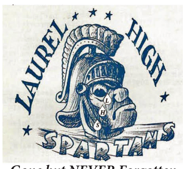
Gone but NEVER Forgotten